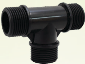
Out Side TEE (KP - 36)