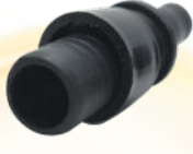
8 x 16 Pepsi Take Off (KP - 50 / 51)