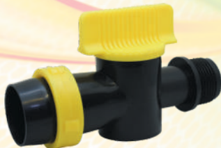
Thred. Cock (KP - 30)