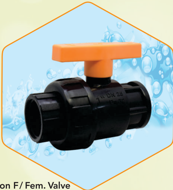
Union F/ Fem. Valve (KP - 40)