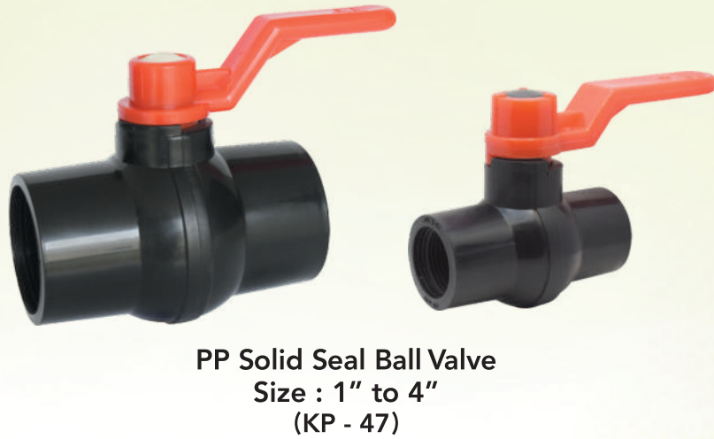
PP Solid Seal Ball Valve Size : 1" to 4" (KP - 47)