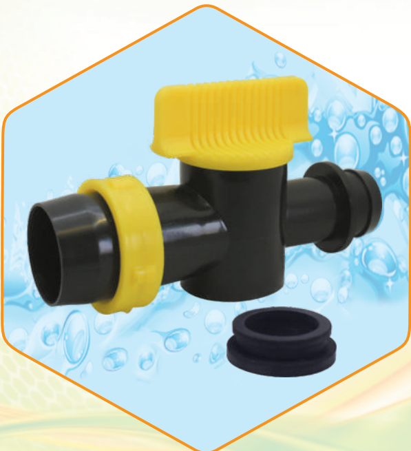
Take off Cock (KP - 30)