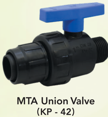
MTA Union Valve (KP - 42)