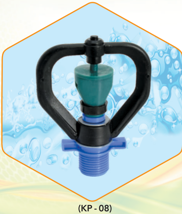
(KP - 08)