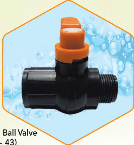
M/F Solid Ball Valve (KP - 43)