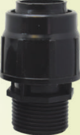
MTA (KP - 35)