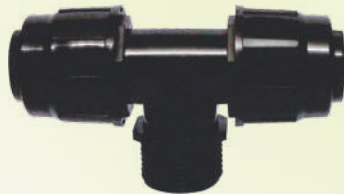
Two Side TEE (KP - 37)