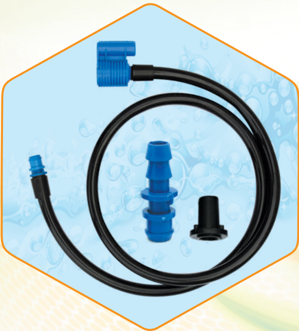
(KP - 09 to KP - 14)