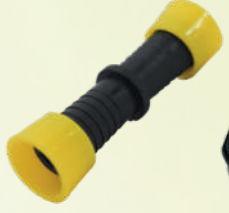
Pepsi Joiner (KP - 59)