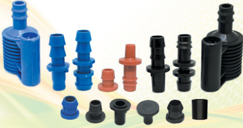
TUBE CONNECTOR (J / N / A) (KP - 15 to KP - 19)