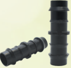
Joiner (KP - 52)