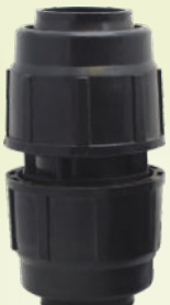
Joiner (KP - 32)