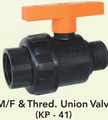
M/F & Thred. Union Valve (KP - 41)