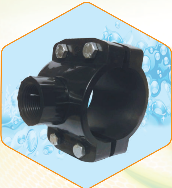
(KP- 20 / KP - 21 / KP - 22)