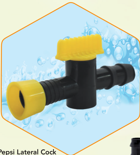
Pepsi Lateral Cock (KP - 61)