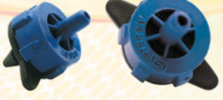
Online Dripper (KP - 58)