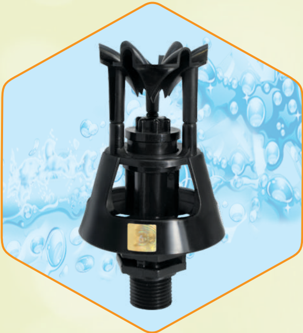
(KP - 05 / KP - 06)