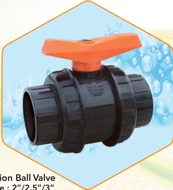
Union Ball Valve Size : 2"/2.5"/3"