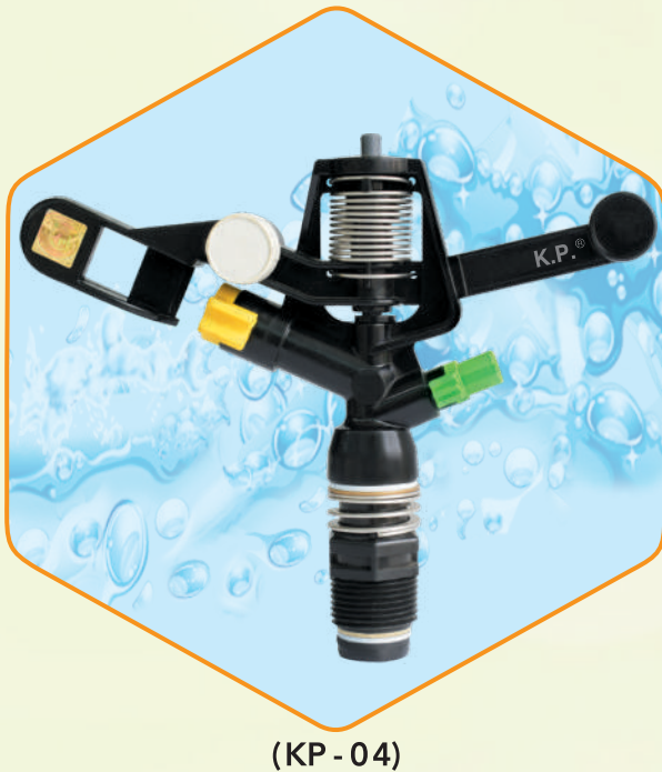
(KP - 04)