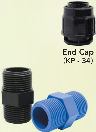
X Nipple (KP - 39)