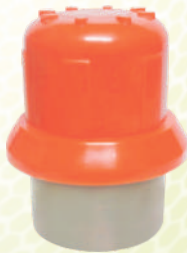
Flush Valve 63 mm x 75 mm (KP - 23 to KP - 25)