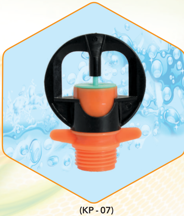
(KP - 07)