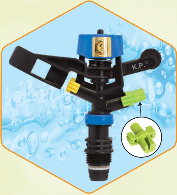
(KP - 01 / KP - 02 / KP - 03)