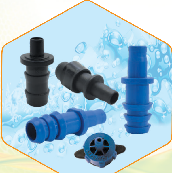
8 x 16 Poly Fittings