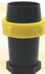
End Cap (KP - 28)