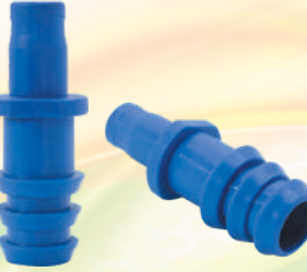
Take Off (KP - 48 / 49)