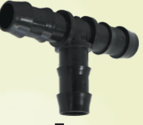
Tee (KP - 55)