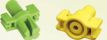
Ruzzer (G/Y) (KP - 62)