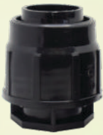
End Cap (KP - 34)