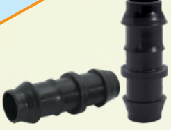
Take Up (KP - 53)