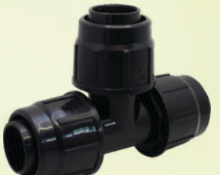
Three Side TEE (KP - 38)