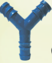
Y Tee (KP - 64)