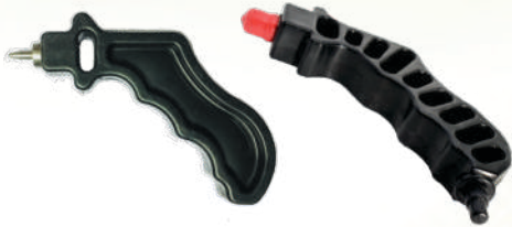
(KP - 26)