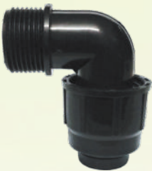
Elbow (KP - 33)