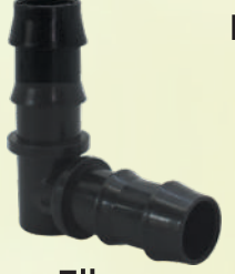
Elbow (KP - 56)