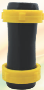
Joiner (KP - 29)