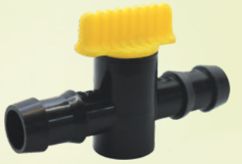
Lateral Cock (KP - 60)