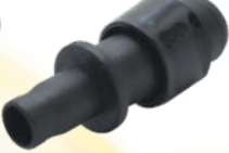
8 x 16 Take Off (KP - 49)