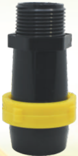
MTA (KP - 27)